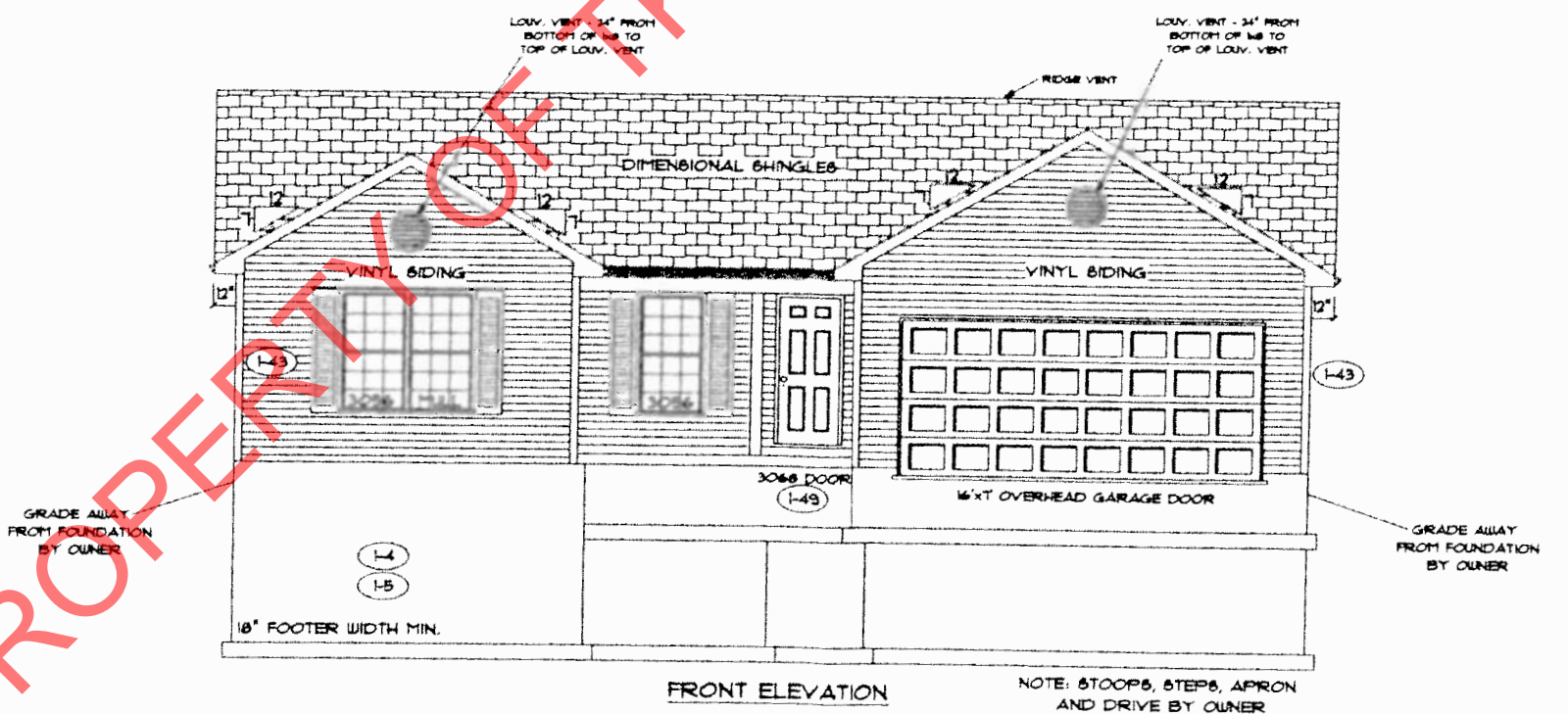
FRONT ELEVATION NOTE: STOOPS, STEPS, APRON AND DRIVE BY OWNER